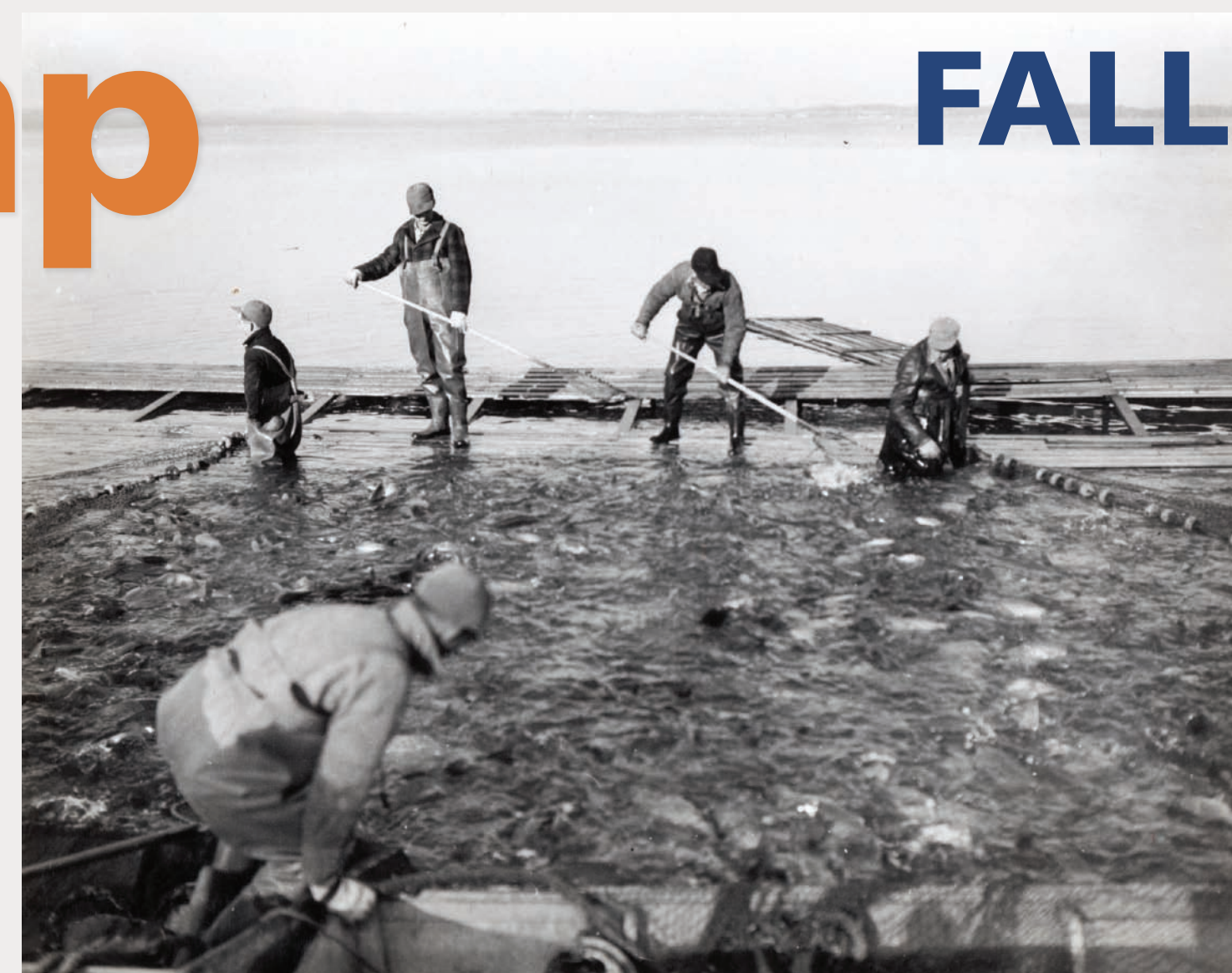
Moving rough fish caught in the seine net (in front) to the crib (background).

Fall was peak seining season, as fish moved into shallows to feed before freeze-up. Single hauls of fish could top 100,000 pounds. When carp schooled together in fall, crews seined them intensively, placing them in holding pens so they could continue fishing.