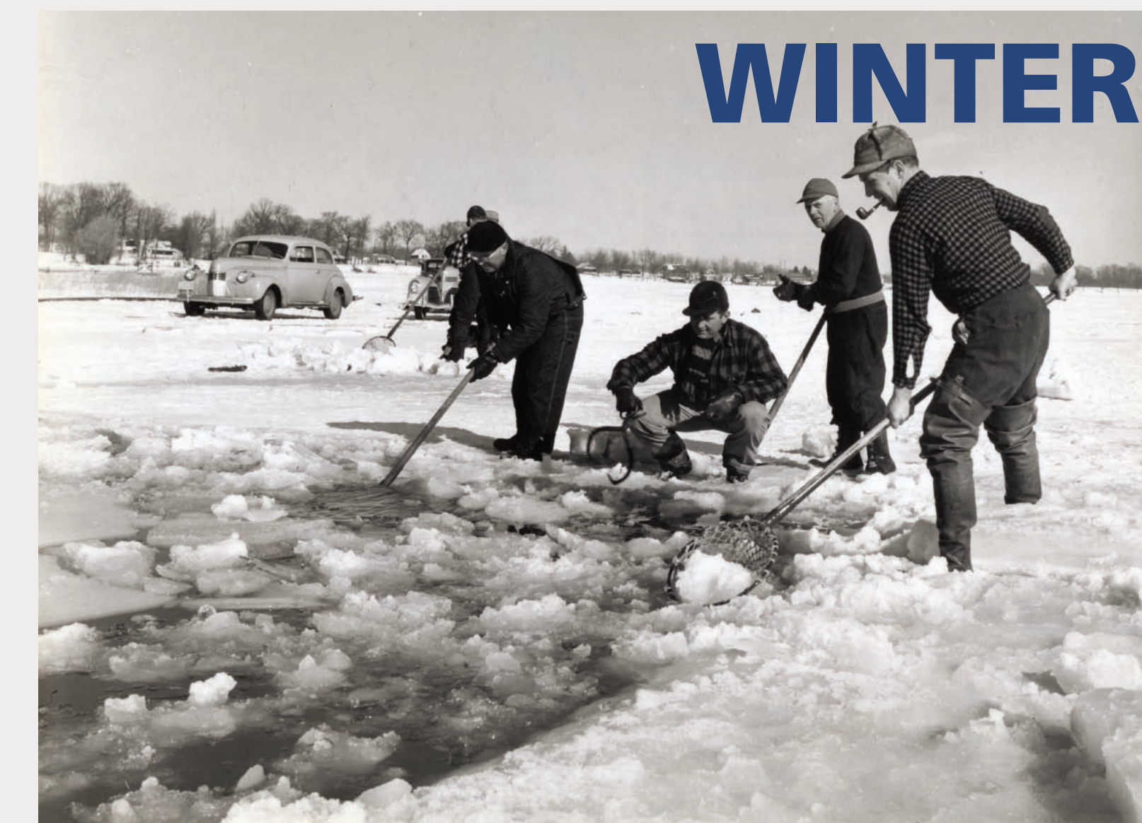
Cutting a 20-ft. x 30-ft. landing hole for a seine net at Lake Muskego in 1941.

Fall was peak seining season, as fish moved into shallows to feed before freeze-up. Single hauls of fish could top 100,000 pounds. When carp schooled together in fall, crews seined them intensively, placing them in holding pens so they could continue fishing.