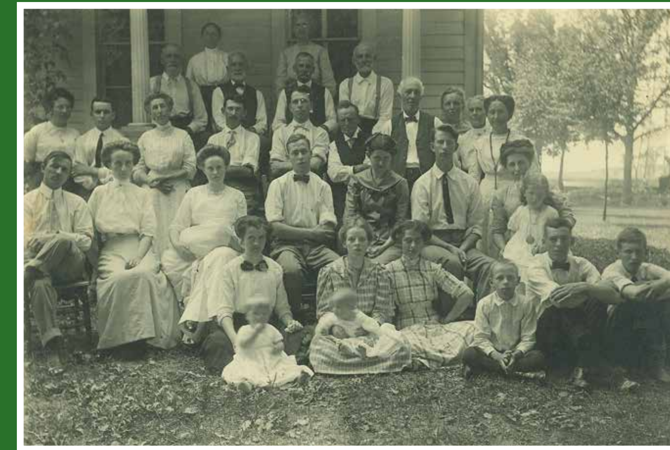
Ames – Sholts – Anderson family - The Ames family, forbearers to the Sholts and Anderson families, settled on this land in the 1800s.