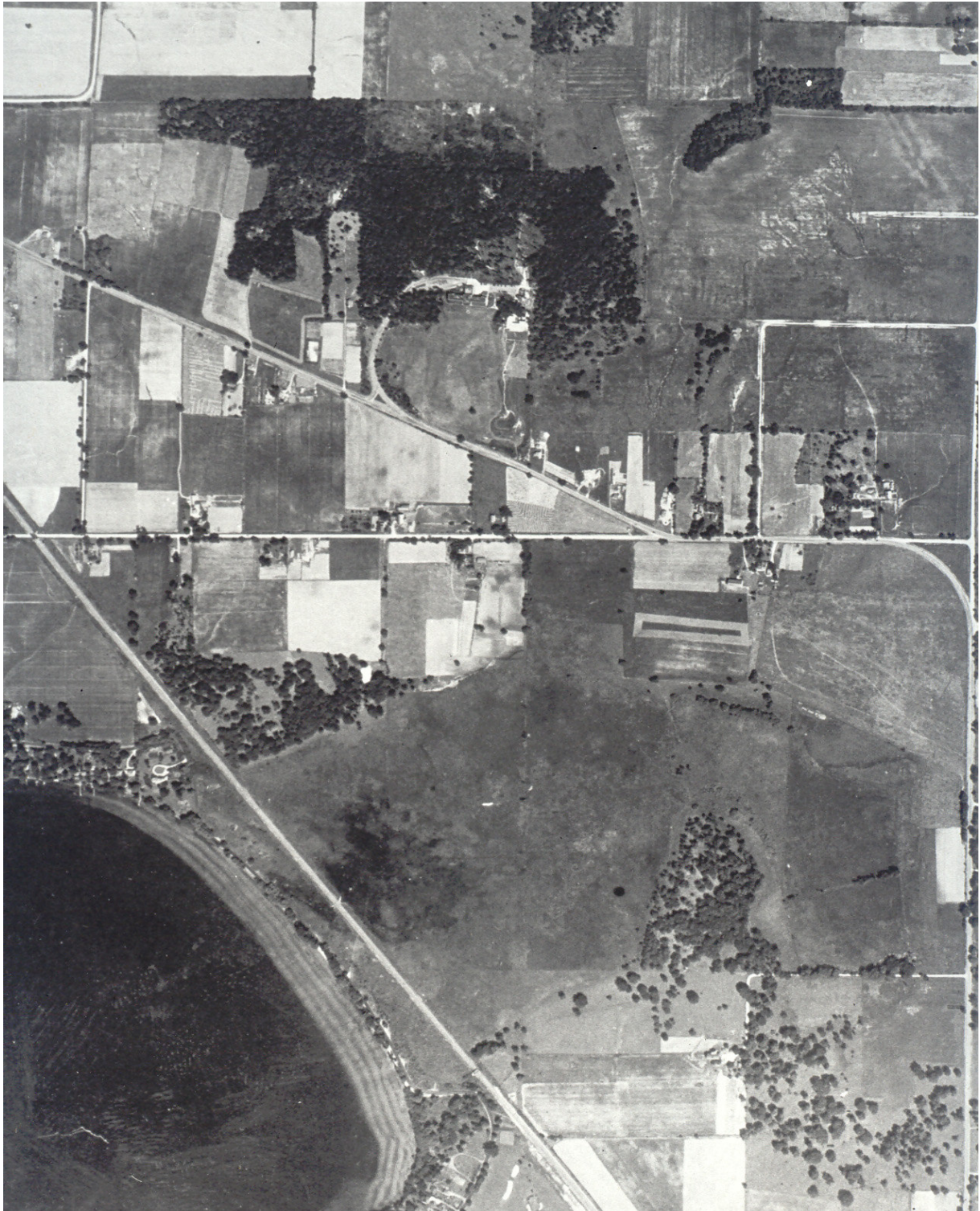
The area northeast of Lake Mendota in 1937. The Lake View Sanatorium and grounds appear in the upper photo. Note outlying areas in the lower photo, where grazing and other land management practices maintained a semblance of the historic savanna landscape.